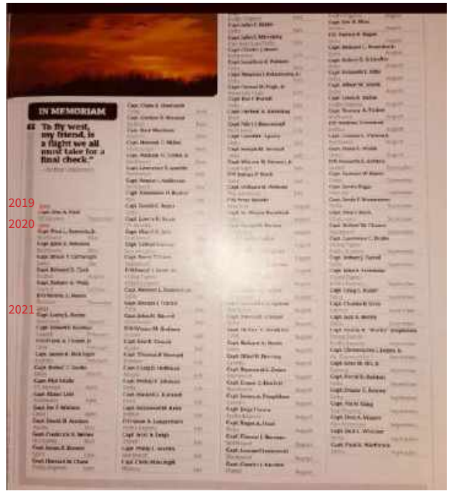
October/November issue of Airline Pilot Magazine (ALPA)